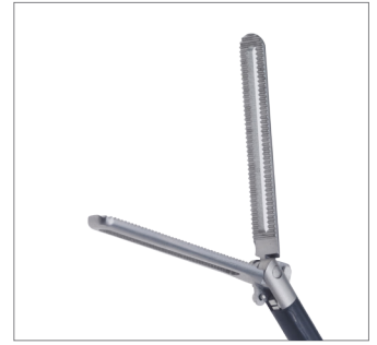
Intestinal Grasping Forceps