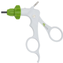
Reusable-style handle Maryland