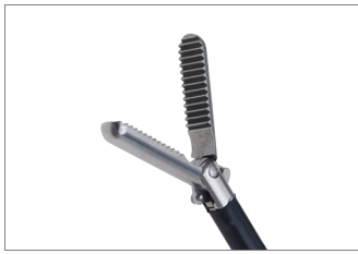
Straight Grasping Forceps