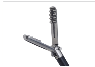
Clinch Grasping Forceps