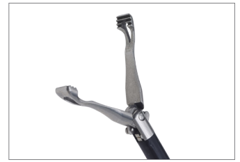
Babcock Grasping Forceps