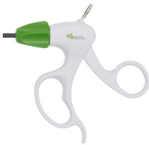
Single-use-style handle Maryland