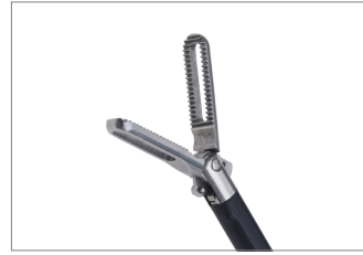
Straight Grasping Forceps – Fenestrated