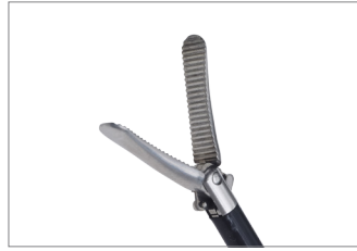
Duckbill Grasping Forceps